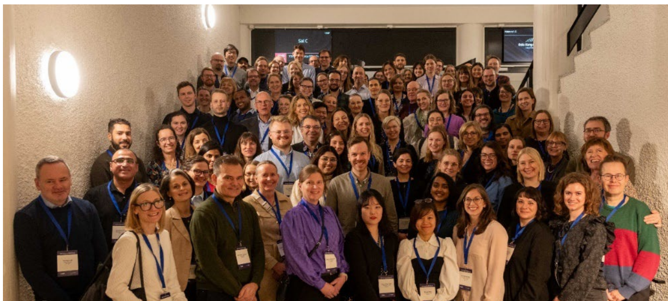
Figure 1 Participants of the 15th Annual NorPEN meeting, November 2023. Oslo, Norway